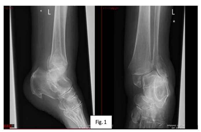
Figure 1. Anterior-posterior and lateral plain film Xrays of initial fracture

in gaining screw purchase in the distal fragment. Distal fibular pro-tibial screws, which were trans-syndesmotic and trans-tibial, were used to provide stability to the remaining distal fibula.