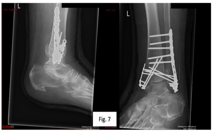
Figure 7. Post-operative anterior-posterior and lateral plain film Xrays of revision ORIF

THE ARCHIVES OF BONE AND JOINT SURGERY. ABJS.MUMS.AC.IR VOLUME 12. NUMBER 5. May 2024