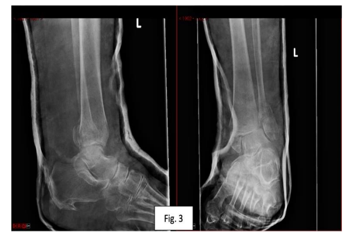
Figure 3. Anterior-posterior and lateral plain film Xrays of initial fracture in a moulded cast at 1 week post-injury, showing loss of reduction and valgus collapse

SALVAGE FIXATION OF BIMALLEOLAR ANKLE FRACTURES - A NOVEL TECHNIQUE