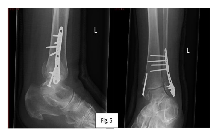
Figure 5. Post-operative anterior-posterior and lateral plain film Xrays of initial ORIF

The medial malleolus fixation was also successfully revised with a combination of partially threaded and cortical screws, as well as a medial buttress plate [Figure 6, Figure 7]. Whilst successful use of fibular pro-tibial screws across the proximal fibula are well described,<sup>1</sup> use of this technique across the distal fragment has not been described previously, to the best of the author's knowledge.