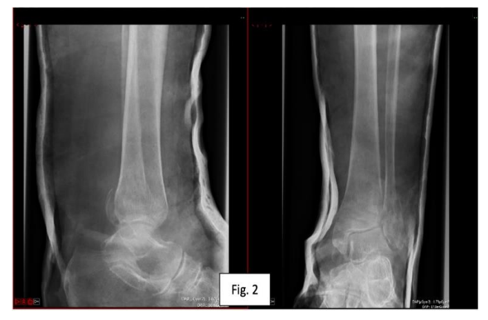
Figure 2. Anterior-posterior and lateral plain film Xrays of initial fracture in a moulded cast, showing an adequate reduction