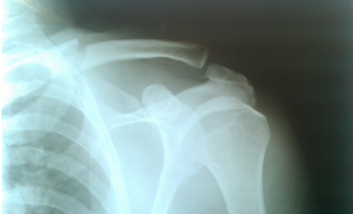
Figure 1. Pre operation x ray showing middle third clavicle fracture along with acromioclavicular joint dislocation.