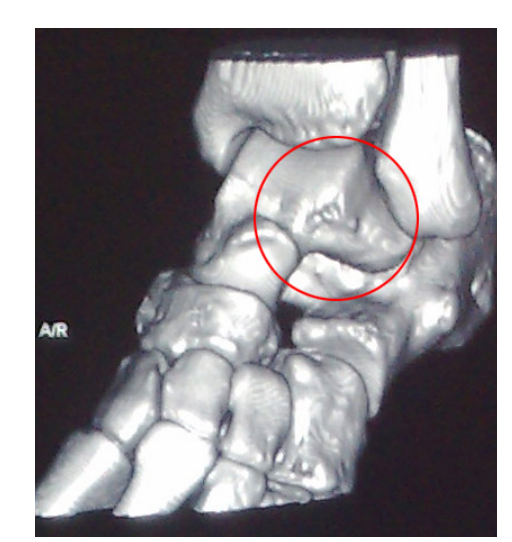
Figure 2 (left) and 3 (right). CT scan view of the talonavicular joint revealing the osseous lesion on top of the distal talar nack.