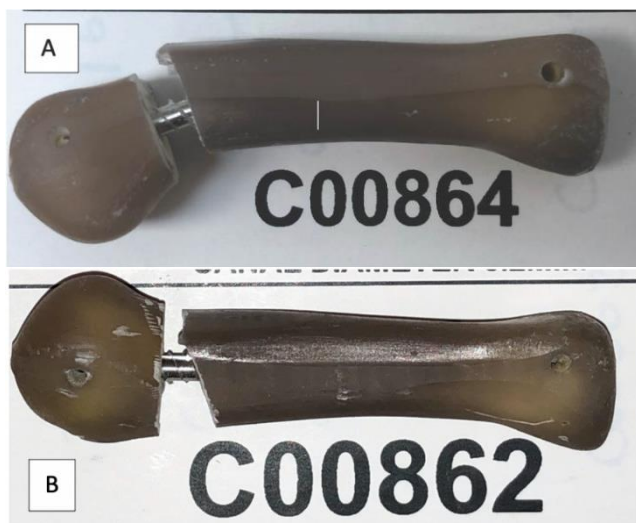
Figure 2. A) Metacarpal model, failure by screw bending. B) Metacarpal model, failure by head rotation

The bone models demonstrated two different failure mechanisms. Eight models failed by bending of the intramedullary screw. Two models failed by rotation of the metacarpal head [Figure 2]. Failure occurred at an average of 539 N (Range 315 – 735 N). The stress /strain curves for the MCHS and previously studied 3mm HS are shown in [Figure 3]. Both constructs show similar characteristics with near linear stiffness (slope of the curve) up to the point of failure. However, the MCHS demonstrated a significantly greater load to failure of 539 N versus 215 N ( P<0.05 ).