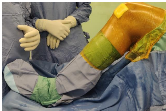
Figure 2. Left knee draped in an antimicrobial incise drape

to get to the aponeurosis [Figure 4]. Moreover, it can be later easily retracted proximally using one Farabeuf retractor to provide access to the tibial drill guide (Arthrex, Naples, FL).