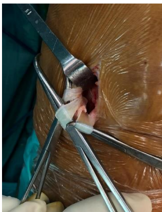
Figure 6. Visualization of the pes anserinus tendons and “fascia”-like appearance of sartorius tendon