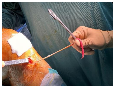
Figure 8. Cleaning muscles fragments out of tendon with a ribbon-present maneuver