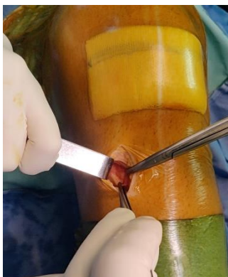
Figure 5. Dissection using Metzenbaum scissors and “bubble-sign”

A bright white plane should be obtained on a good work surface before going further. Only one Farabeuf retractor positioned on the medial edge of the skin incision is sufficient to obtain adequate exposure. Then, a gloved finger efficiently palpates the superior edge of the “speed-bump” which represents the superior border of the sartorius fascia, overlaying the HS tendons. The upper border of the “speed-bump” is firmly taken hold by dissection forceps and gently incised using Metzenbaum scissors: it will resemble the bursting of a bubble as it enters the pes anserine bursa [Figure 5]. Still grasping the bump with the forceps, the Metzenbaum scissor slides proximally for 3 cm along the superior border of the bump. The dissection forceps now retract the inferior lip of the bump downwards. This is the sartorius fascia, on the deep side of which two tendons are visible: the gracilis is above and proximal to the semitendinosus and has a rounded-shaped muscular belly; the semitendinosus is deep and distal to the gracilis and has a U-shaped muscular belly. Sometimes, identification of the individual tendons can be difficult with the fascia getting in the way or due to the tendon-like appearance of the fascia [Figure 6]. The authors suggest to carefully evaluate the elasticity of these structures, with the more elastic ones representing the tendons, and the stiffer one representing the fascia. The opted tendon can now be grasped, with the help of a hook.