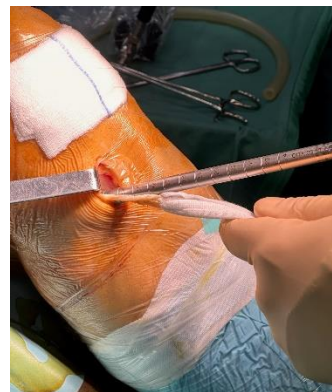
Figure 7. Stripping of gracilis tendon

Usually, the gracilis is harvested first. Current anatomic ACLR and fixation techniques use multiple-stranded HS autografts with an ideal tendon length greater than 21 cm. 16 The tendon can be pulled when the stripper is at the desired length to avoid damage to the muscle bellies of the HS tendons [Figure 7]. The stripper should not be used if it does not flow smoothly along the tendon: it may be halted by expansions and is responsible to cut the tendon rather than the expansion, resulting in a short graft. Maintaining distal insertion can be helpful to leave the tendons inserted distally on onto the tibia to eradicate muscle fragments using an open Mayo scissor, in a maneuver that resembles curling a ribbon for a birthday present [Figure 8].