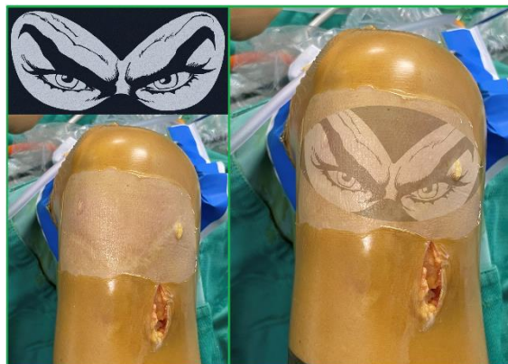
Figure 3. “Diabolik”-like appearance of the knee