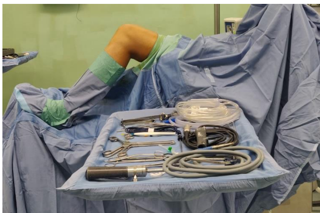
Figure 1. Patient positioning and room setup for knee arthroscopy

A bilateral knee examination is carried out to evaluate any concomitant ligament instability and to evaluate range of motion. After the under-anesthesia examination, a padded non-sterile tourniquet is placed high around the thigh to operate. The patient is placed in the usual arthroscopy position, with lateral backing at the tourniquet height and a foot stop to permit the knee to be maintained at 90° of flexion when needed. The leg to operate is prepared and draped in a standard fashion [Figure 1].