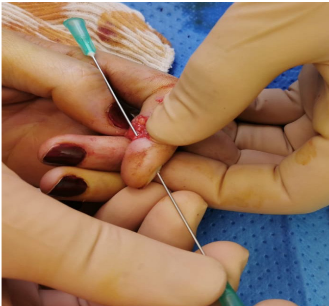
Figure 2. The second needle is pushed on the tip of the first needle and replaces the first needle.

As a result, each nylon suture thread is attached to the