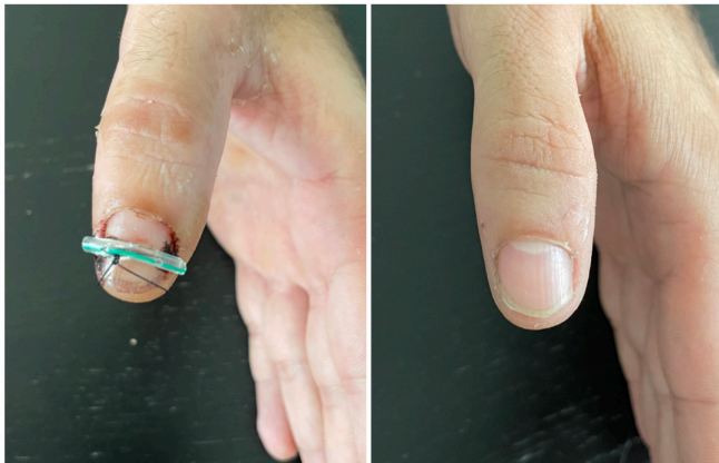
Figure 7. Three weeks after surgery of pull-out suture fixation. The same patient at nine months of follow-up with a normal nail.