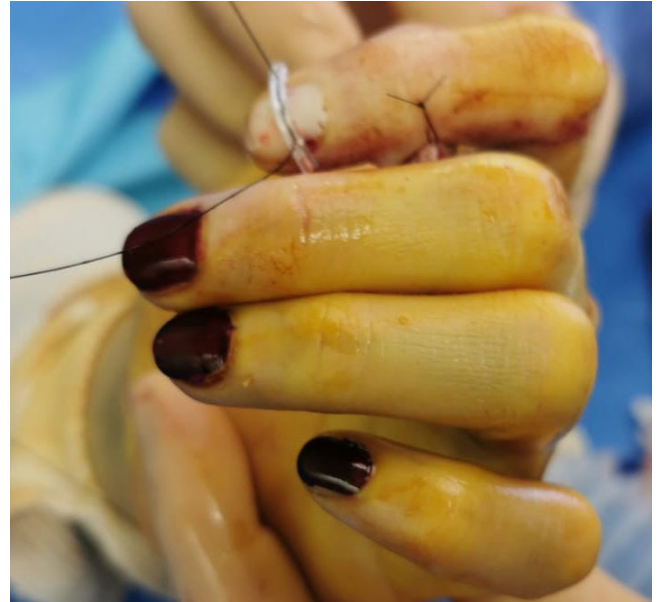
Figure 6. Tightening the knot till obtaining harmonious flexion figures cascade.

The inclusion criteria were zone one flexor tendon injury, including laceration and avulsion injuries, ability to adhere to the early protected active motion protocol