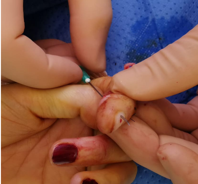
Figure 1. Needle is passed through tendon remnants along the side of the distal phalanx and exits through the nail plate, not engaging the nail folds.

tip of the tendon, and the needle of the nylon suture is then cut. The same trajectory sequence of a 21-gauge hypodermic needle is used at the other side of the distal phalanx, and the other end of the nylon suture thread is passed through the needle from volar to dorsal, providing a second fixing point [Figure 4].