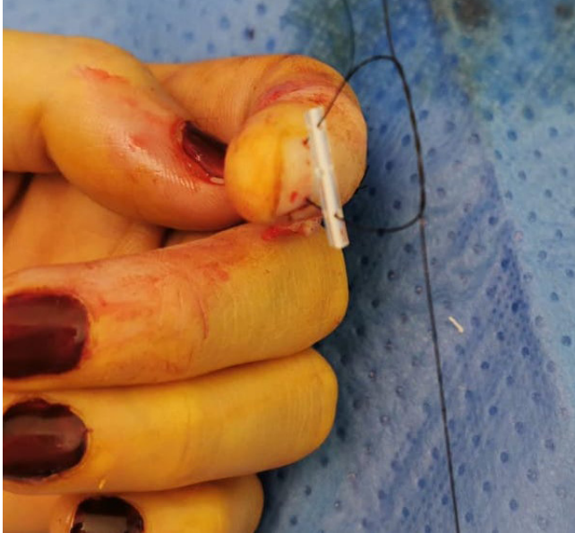
Figure 5. Passing the Nylon sutures into the plastic tube at two different holes and double non-locking knot of Nylon suture.

holes to form a gutter. Here, a non-locking double knot is made and gently tightened or released in the gutter until obtaining the optimal tendon tension [Figure 5]. The goal is to obtain a physiological digital flexion cascade when the wrist is in extension and a complete extension of the injured finger when the wrist is in flexion [Figure 6]. Once good tension is obtained, several locking knots are made, and the stability of the fixation is checked.