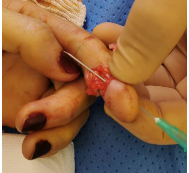
Figure 3. Second needle in place.

tendon by a modified Kessler suture and is running at each side of the distal phalanx, piercing the nail bed and exiting from the nail plate, adjacent to but away from the lateral nail folds at the dorsum of the distal phalanx.