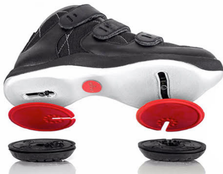
Figure 2. The Apos System biomechanical footwear (AposTherapy®) is shown (image taken from the Internet).

In 2010 Bar-Ziv et al reported a prospective controlled study on the impact of management with Apos System on the level of pain in patients with knee OA (10) [Figure 2]. Fifty-four patients with bilateral knee OA were enrolled to treatment (N=29) and control (N=25) groups. Patients were assessed before treatment, and at 4 weeks and 8 weeks. The biomechanical footwear used in this study was individually adapted to each patient in the treatment group. In the control group, an exactly identical foot platform was placed (so that the footwear could not be distinguished from the real footwear), but without the biomechanical structures of