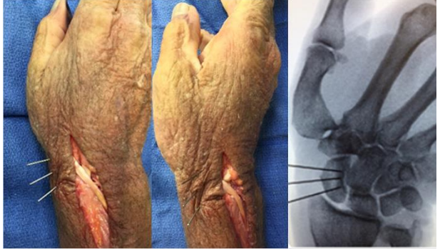
Figure 1. (a) Anterior to posterior view of dorsal scaphoid exposure and Kirschner wire placement for scaphoid resection planning. (b) Lateral view. (c) Anterior to posterior radiograph showing Kirschner wires delineating planned scaphoid resections levels of 25, 50, and 75%.

Six fresh frozen cadaveric upper extremities including the wrist, forearm, and elbow were prepared according to institutional protocols. They were thawed at room temperature and affixed to wooden supports with two screws placed through each radius. The wrist and forearms were positioned in neutral while the elbows were flexed to 90°. A dorsal approach was used to expose the scaphoid as described by Malerich et al (1). The dorsal wrist capsule was divided in line with the mid-dorsal intercarpal and mid-dorsal radiocarpal ligaments to create a radially-based flap as described by Berger et al (9). During our dissections, care was taken to avoid damaging the scapholunate ligament which was manually probed to confirm its integrity. Three 0.045" Kirschner wires were driven into the radial aspect of the intact scaphoids to mark planned resection levels of 25, 50, and 75% of each scaphoid length [Figure 1].