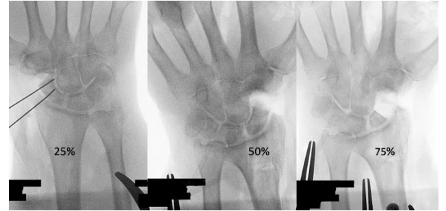
Figure 2. (a) Anterior to posterior view of a wrist in neutral in neutral position following 25% distal scaphoid resection. (b) Following 50% distal scaphoid resection. (c) Following 75% distal scaphoid resection.

increasing scaphoid resection with noted clinical impingement on 2 out of 6 cadaveric specimens after 75% scaphoid resection and 1 out of 6 cadaveric specimens after 50% scaphoid resection; however, this variable did not achieve statistical significance. First metacarpal subsidence, carpal height ratio, and percentage of ulnar carpal translation did not show statistically significant changes with increasing scaphoid resection [Table 1].