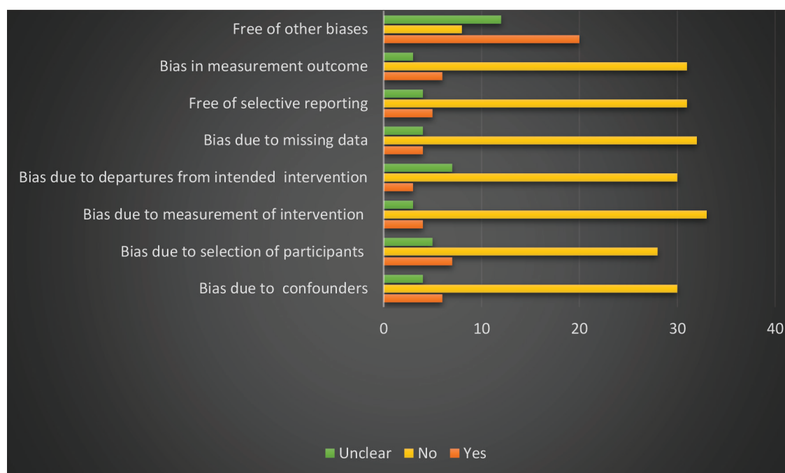
Figure 2. Quality assessment of the articles included in the review process.

Due to the irreparable complications of TKR, the discussion on this issue is very important. However,