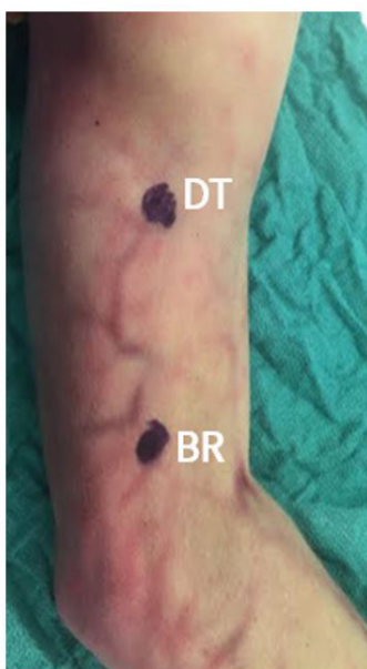
Figure 1. Deltoid Tuberosity and the Origin of Brachioradialis.

We first superficially marked the deltoid tuberosity and the origin of brachioradialis, and drew a line for an incision between the two superficial landmarks [Figure 1]. We dissected down to the fascia and identified the lateral intermuscular septum (LIS). Then the dissection was further carried out to expose proximally to the deltoid tuberosity and distally to the origin of brachioradialis. We then exposed the deltoid