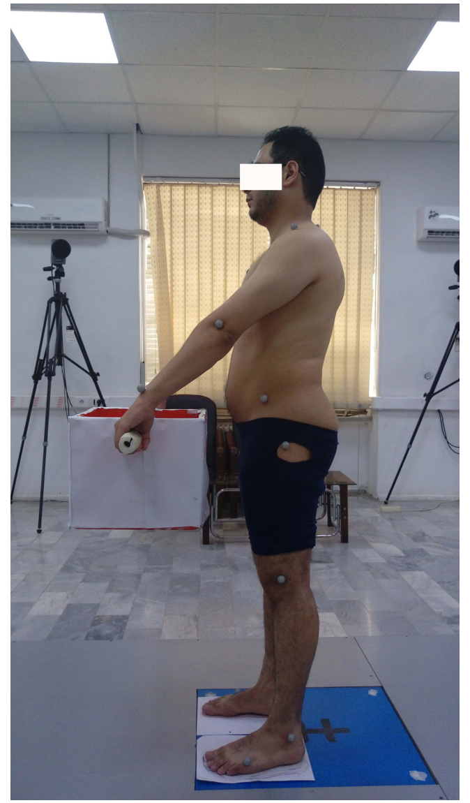
Figure 1. Waist level of box (Used with permission).

boxes that weighed 10% of their body weight. The box dimensions were 34 (width) ×34 (length) ×27 (height) cm. While lifting the box from the ground, the upper limb position was vertical, and the box was placed under the participant's hands [Figure 1]. The subjects stooped and lifted the box by both hands from the ground to the waist level and held it for 20 seconds (19, 20). The examiner emphasized holding the elbows and knees straight during the test. According to this method, the lifting test was divided into two phases of static and dynamic. A motion analysis system (a 6-camera motion capture system, Qualisys AB, Sweden) was used to divide the static and dynamic phases of the test. The system recorded vertical displacement of the marker