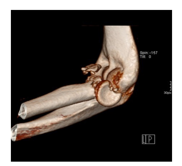
Figure 5. 3-D computed-tomography scan demonstrating a Mason type IV fracture with elbow dislocation and fracture of the coronoid process in a 42-year-old male patient leading to functional instability.

Figure 4. Long-term results in terms of pain (VAS) and Kellgren-Lawrence osteoarthritis grading scale of subgroups 1, 2 and 3 in patients with Mason IV fractures [points] (VAS: maximum 10 points, Kellgren-Lawrence scale: grade 0-4; median) (22, 32).