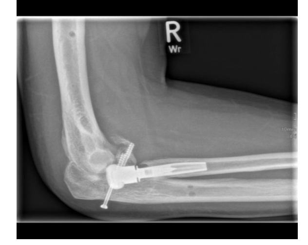
Figure 2. Secondary subluxation of primary inserted radial head resection arthroplasty.