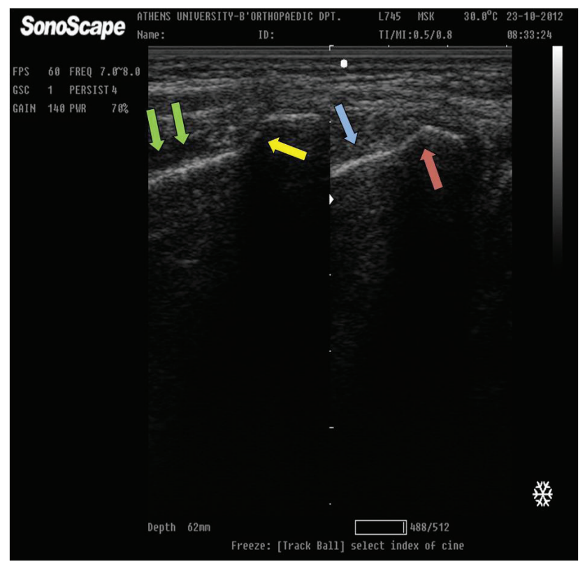
Figure 2. Comparative ultrasound image: Left: Clear cortical discontinuity in the radial head junction (yellow arrow) combined with subperiosteal hematoma (anechoic area) lying distally on the radius cortex (green arrows). Right: Normal radial head (purple arrow) and radial metaphysis without any hematoma (light blue arrow) in the contralateral elbow of the same patient.