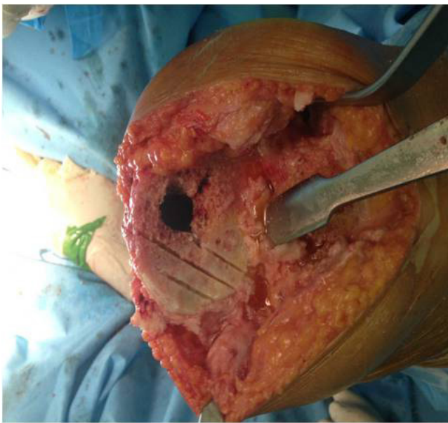
Figure 4. Furrowing of tibia for better contact of bone -cement.

have to double check the tibial cuts to avoid varus or valgus also the posterior slope should point exactly posterior rather than posteromedial or posterolateral.