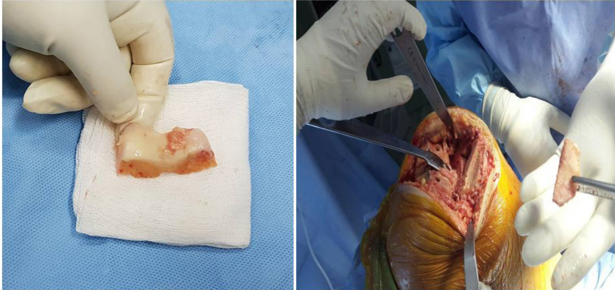
Figure 3. Achieving big piece of bone with the change the order of bone cut and use as a bone graft for tibial defect.